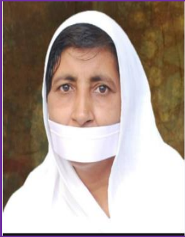
SADHAVI SAMTA SHRI